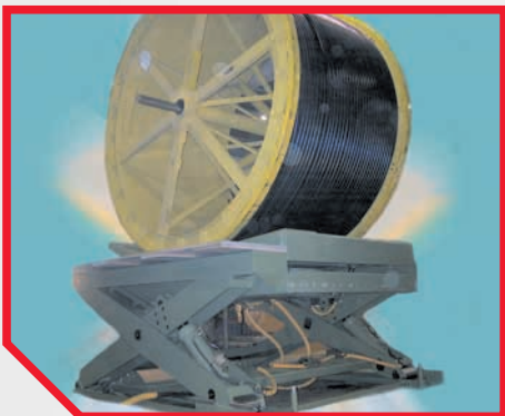
Lifting table application.