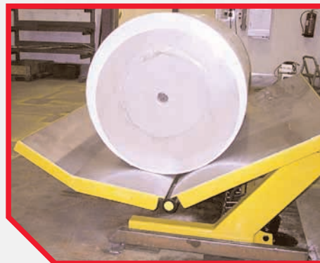
An alternative for lifting table.