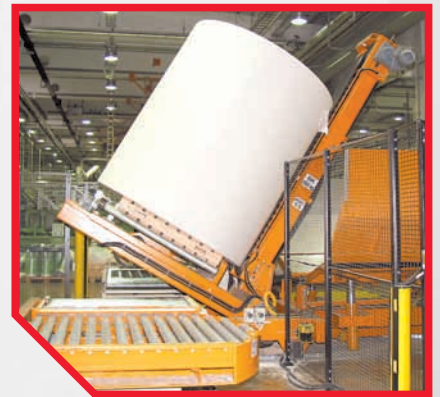
Turning of roll to Rolleri.